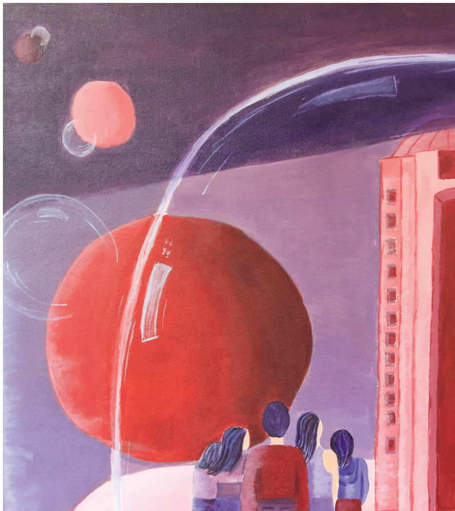
Illustration by PXHS student

The primary focus is on connecting the child and/or family to resources and materials to support them. Potential outcomes are also listed on the bottom of the flowchart.